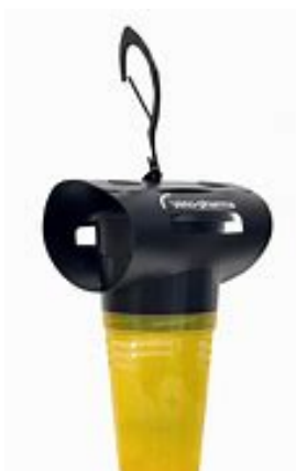
Veto-pharma Vesps Catch Select