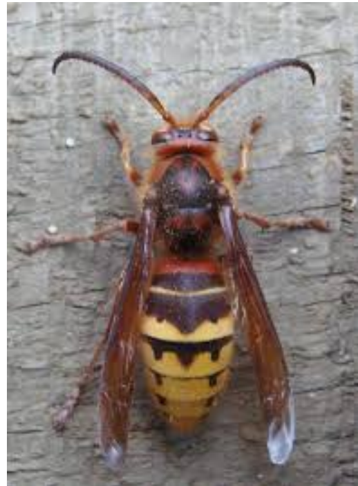
European Hornet (native) Vespa crabro (Larger; workers typically 25mm long; queens 25-35mm long)